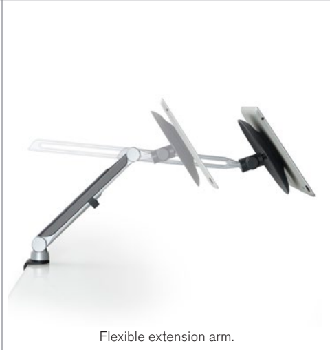
Flexible extension arm.