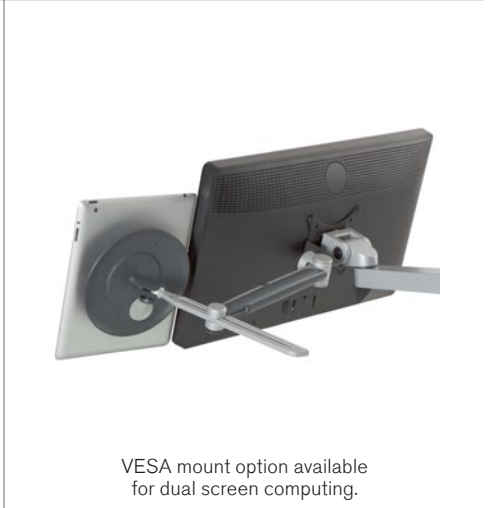
VESA mount option available for dual screen computing.