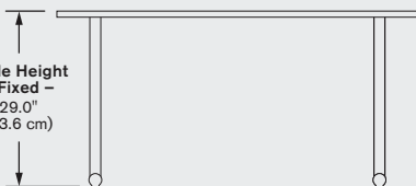
Table Height - Fixed - 29.0" (73.6 cm)